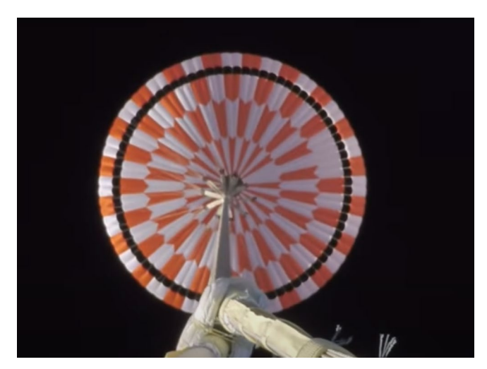
Parachute deployed on sounding rocket flight.

All three flights met their comprehensive success criteria.