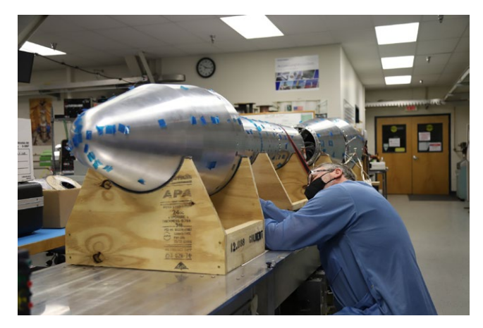
Payload integration at Wallops Flight Facility.