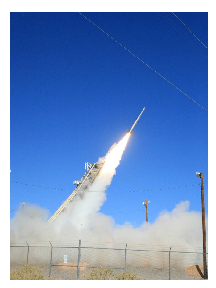
Vehicle on launcher at White Sands Missile Range.