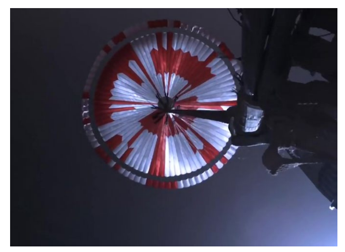
Parachute deployed on Mars.